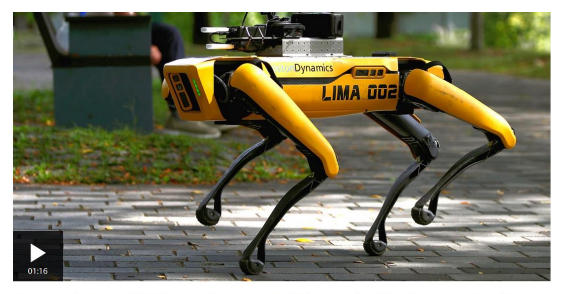
Coronavirus: Robot dog enforces social distancing in Singapore park